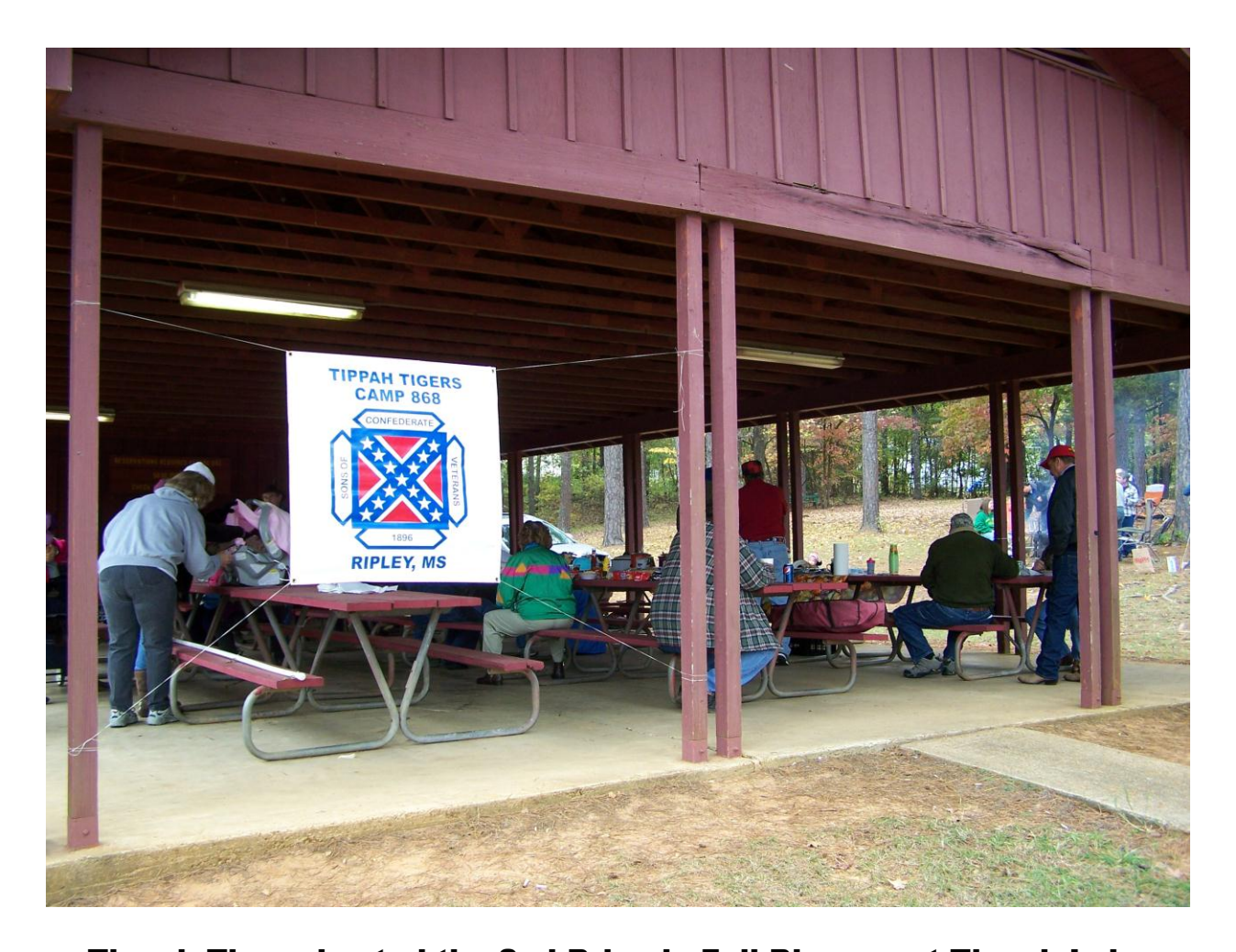
Tippah Tigers hosted the 2nd Brigade Fall Bivouac at Tippah Lake October 27. Sons of Confederate Veterans members, their families and guests enjoyed a beautiful, cool fall day at the lake with plenty of chili, fun and fellowship.